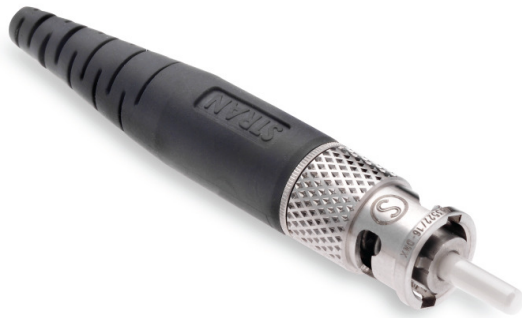
MIL-PRF-83522/16-DNX ST Connector

STRAN Technologies' MIL ST connectors and adapter are designed for harsh environment applications including military shipboard, aerospace, and land based optical data communication systems. The connectors are available in both Multimode and Singlemode configurations and have been tested to meet the requirements of military specification MIL-PRF-83522/16-DNX and /16-DNY respectively. STRAN has also qualified the MIL ST-ST Adapter to the specification MIL-PRF-83522/17-NY. Some of the applications supported by STRAN's MIL ST's and adapter include: